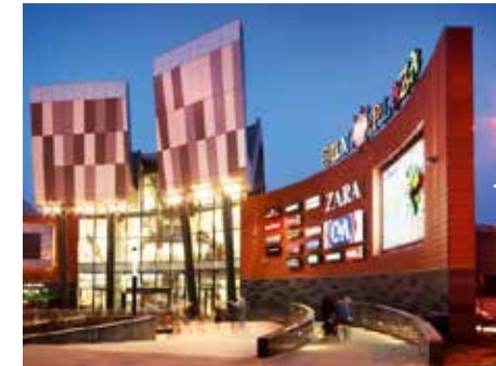
SHOPPING MALL SUN PLAZA BUCHAREST, ROMANIA