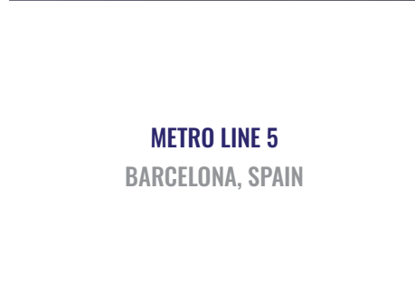
METRO LINE 5 BARCELONA, SPAIN