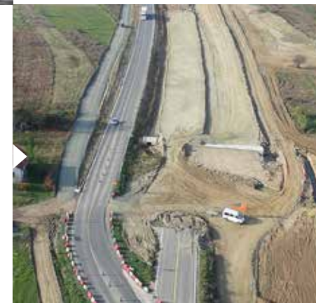
DN76 STEI-BEIUS ROMANIA