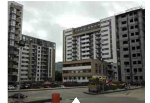
RESIDENTIAL PROJECT GRAN VIA PARK BUCHAREST, ROMANIA