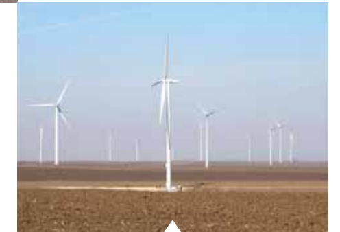
WIND FARM ENEL DOROBANTU CONSTANTA, ROMANIA