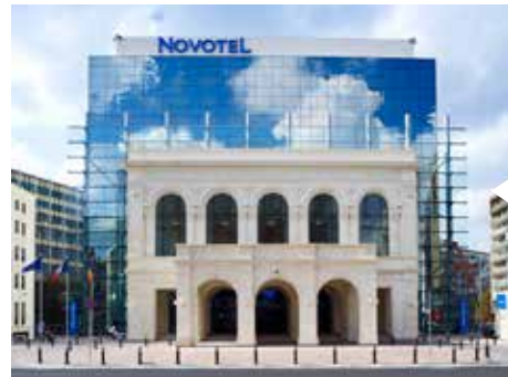
HOTEL NOVOTEL BUCHAREST, ROMANIA