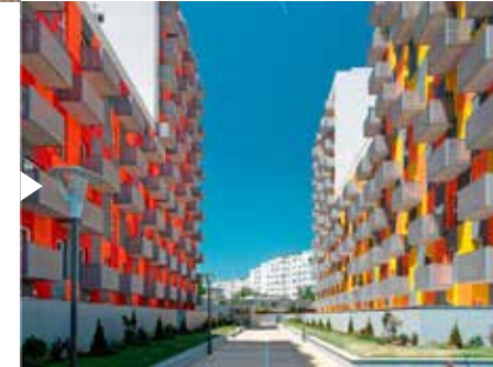
RESIDENTIAL PROJECT GRAN VIA PARK BUCHAREST, ROMANIA