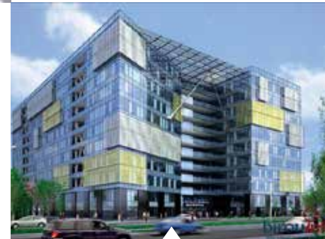
OFFICE BUILDING METROPOL BOULEVARD TIMISOARA BUCHAREST, ROMANIA