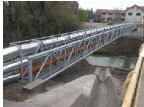
EXTENSION OF WATER SUPPLY AND SEWAGE BRAGADIRU, ROMANIA