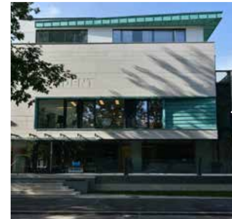
DESIGN AND BUILD MEDICAL CLINIC BUCHAREST, ROMANIA