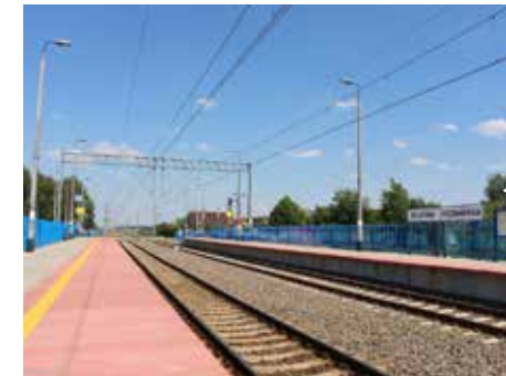
RAILWAY REHABILITATION CZEMPIN-POZNAN POLAND