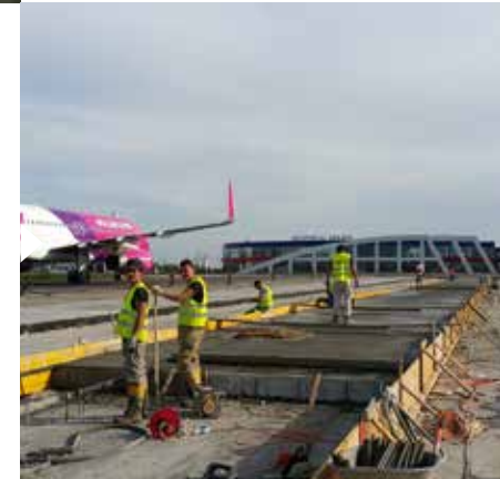
DESIGN AND BUILD EXTENSION CRAIOVA AIRPORT CRAIOVA, ROMANIA