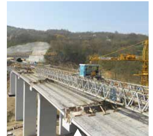
CONSTRUCTION OF HIGHWAY E75, LOT 6 SERBIA