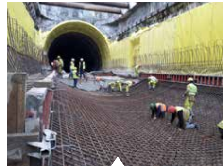
RAILWAY SIGHISOARA-ATEL CORRIDOR IV - DANES TUNNEL ROMANIA