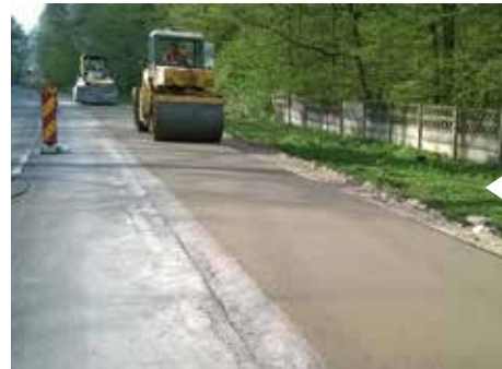
MODERNIZATION OF DN73 ROAD PITESTI-CAMPULUNG-BRASOV ROMANIA